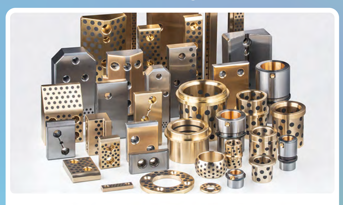
1210 Thrust washer bronze with non-liquid lubricant