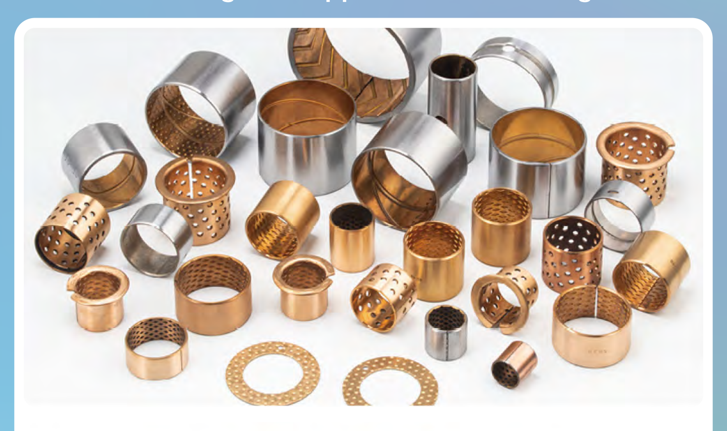
5620 Bi-metal Self-lubricating Bearing