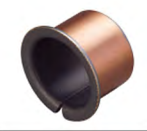
5422 Marginal Pb-free Selflubricating Bearing