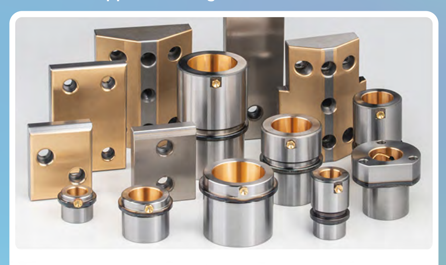
2710 Copper base powder metallurgy bimetallic Guide plate