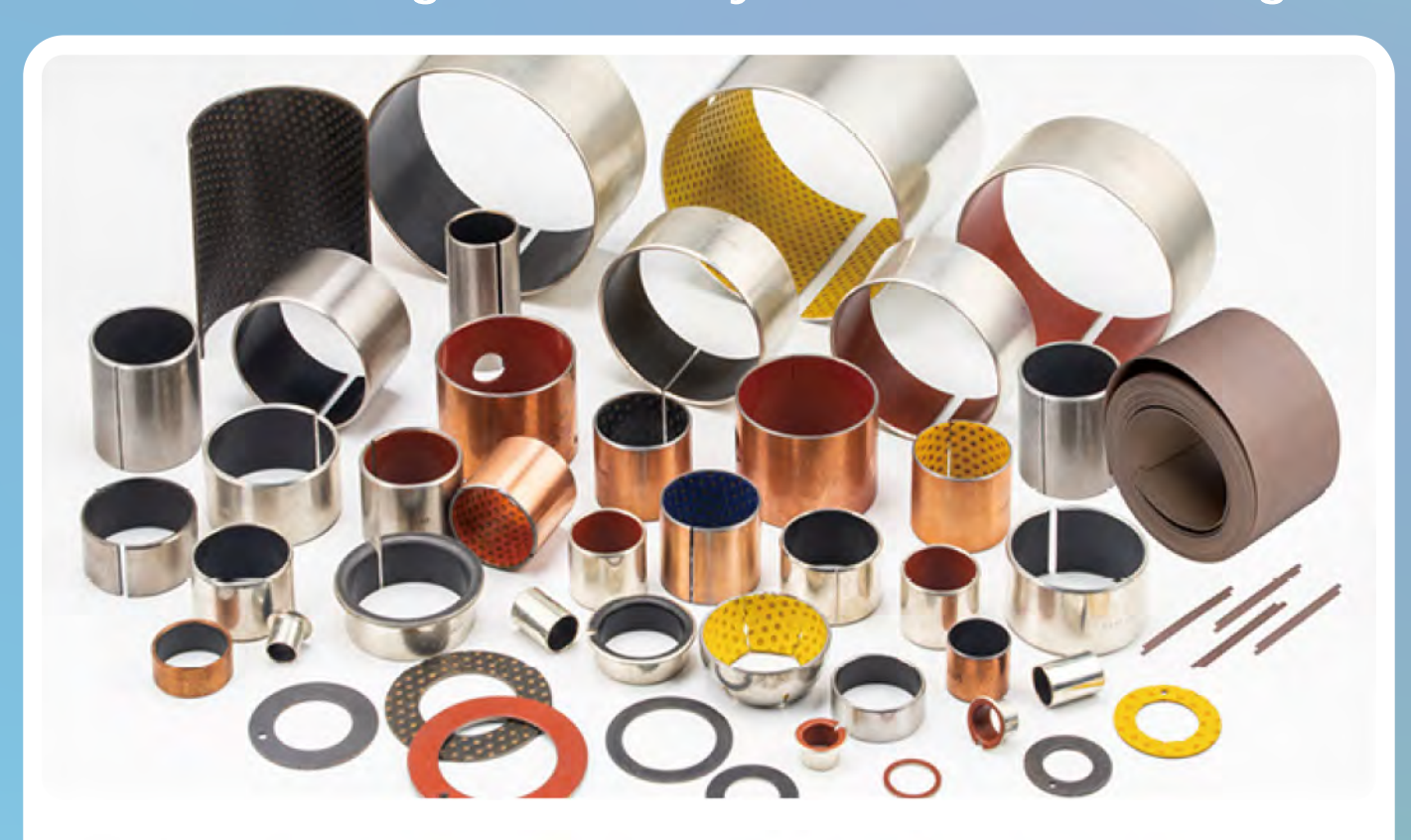
5220 Carbon Steel Selflubricating Bearing